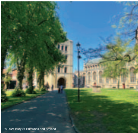
© 2021 Bury St Edmunds and Beyond